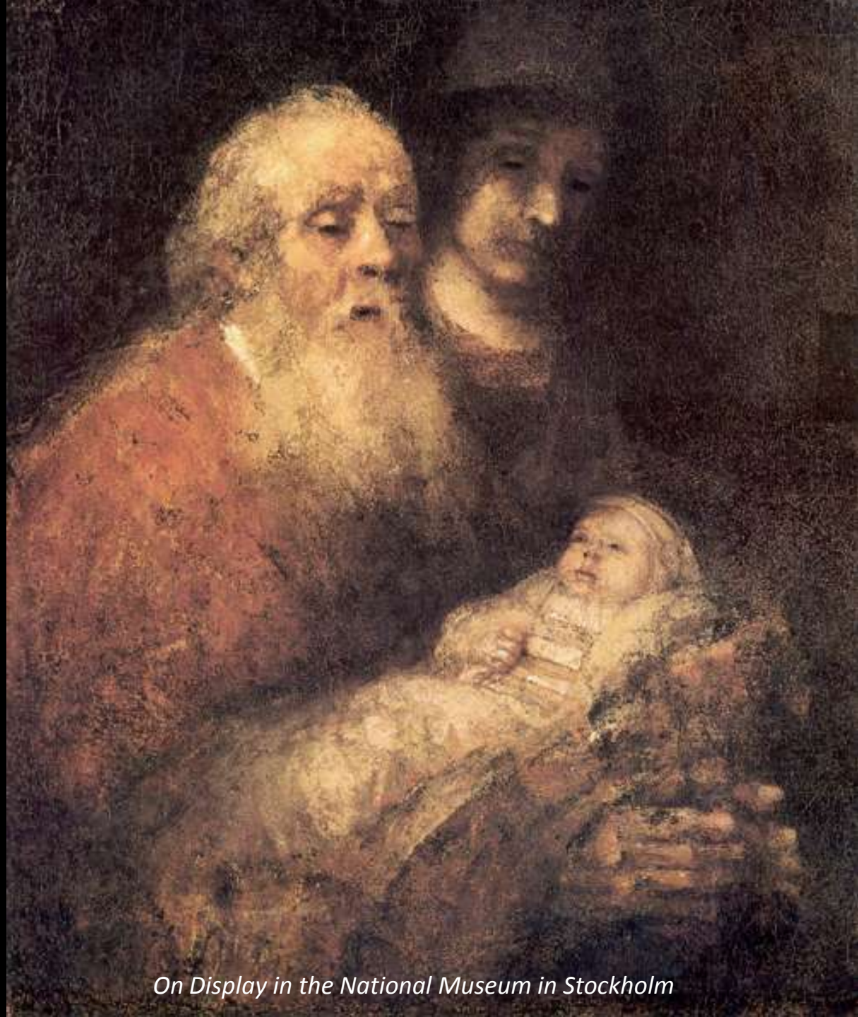
On Display in the National Museum in Stockholm