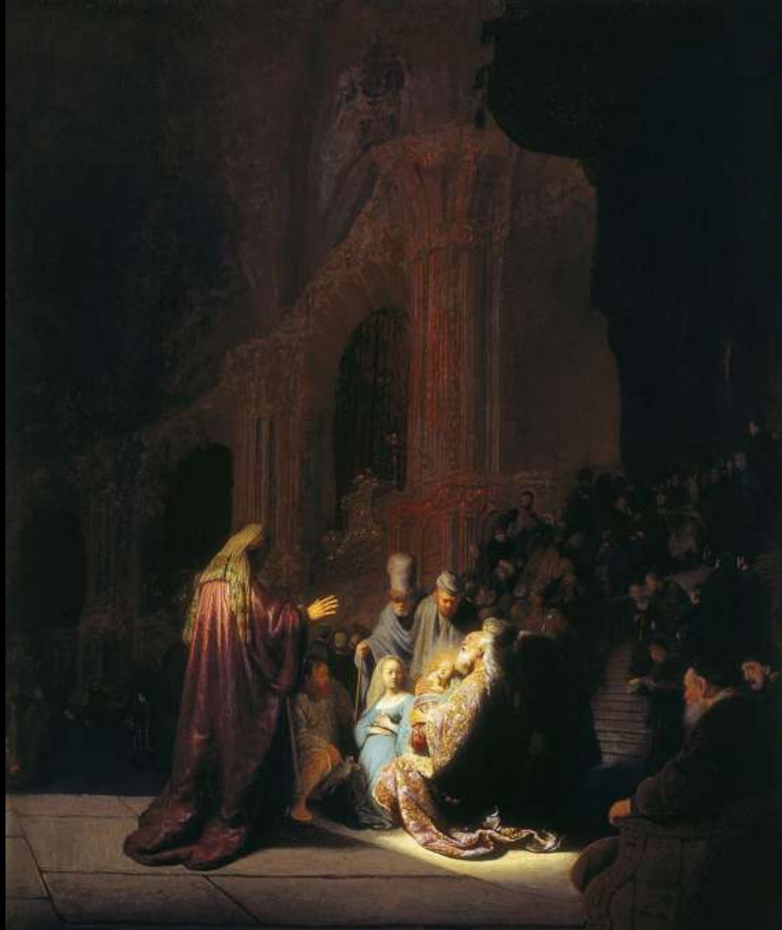
On Display in Mauritshuis, the Hague